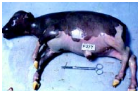
An aborted fetus

L. hardjo infection is a zoonosis; the infection is transmissible to man. Sources of infection for humans include urine, uterine discharges and abortion material. Antibiotic therapy of infected animals with streptomycin helps reduce the human health risk rapidly. Although infection is present in the milk it quickly dies off once taken from the udder as the fats present in milk are toxic to leptospira. Pasteurisation of milk will eliminate the organism, so milk from herds undergoing milk drop does not pose a health hazard to man if it is pasteurised.