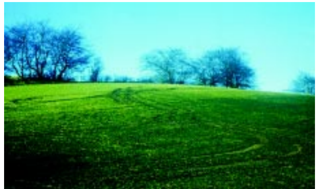
Consider slope when making risk assessment.