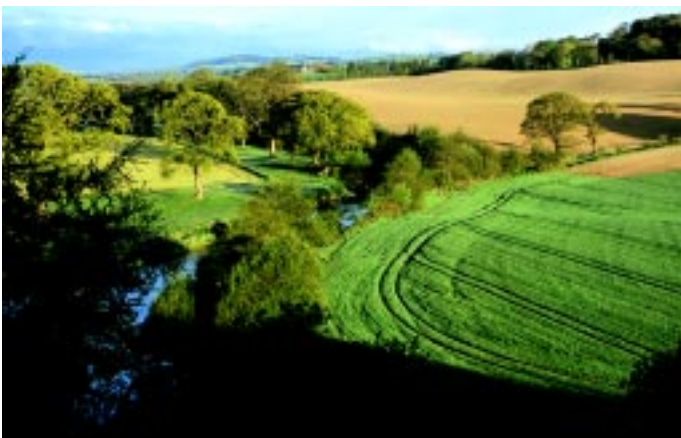
Maintain 10m no-spread zone around watercourses.