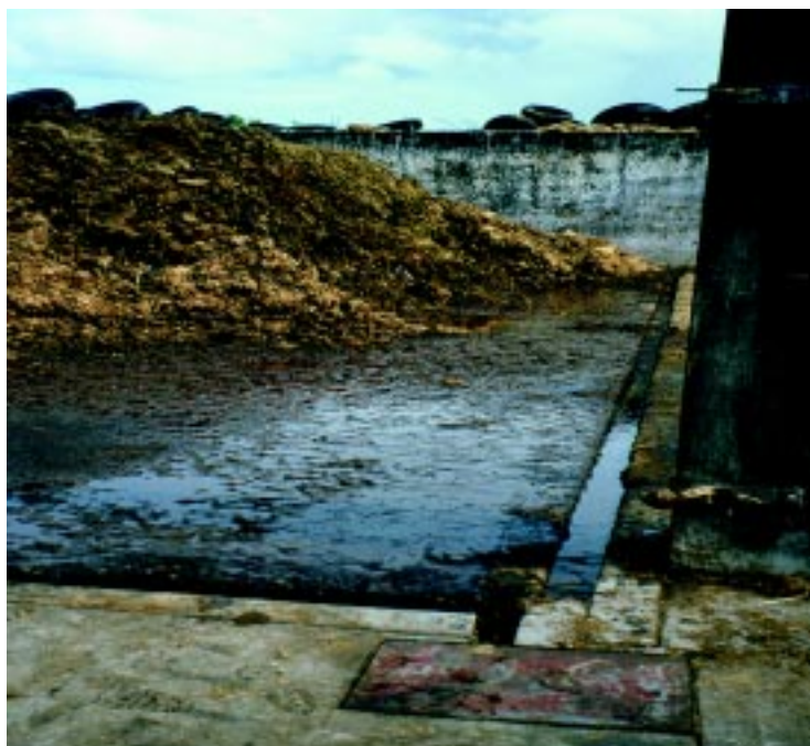
Midden run-off contains high levels of nutrients and bacteria.