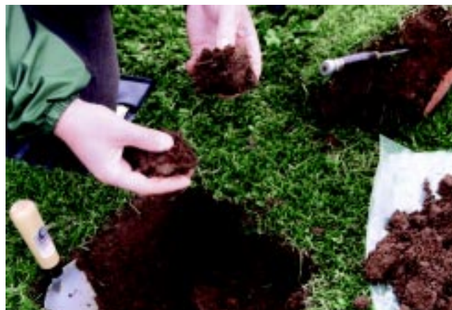
Soil testing can lead to savings.