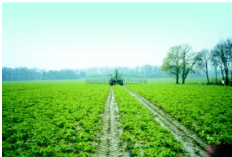
Matching slurry application to crop demand maximises nutrient use.