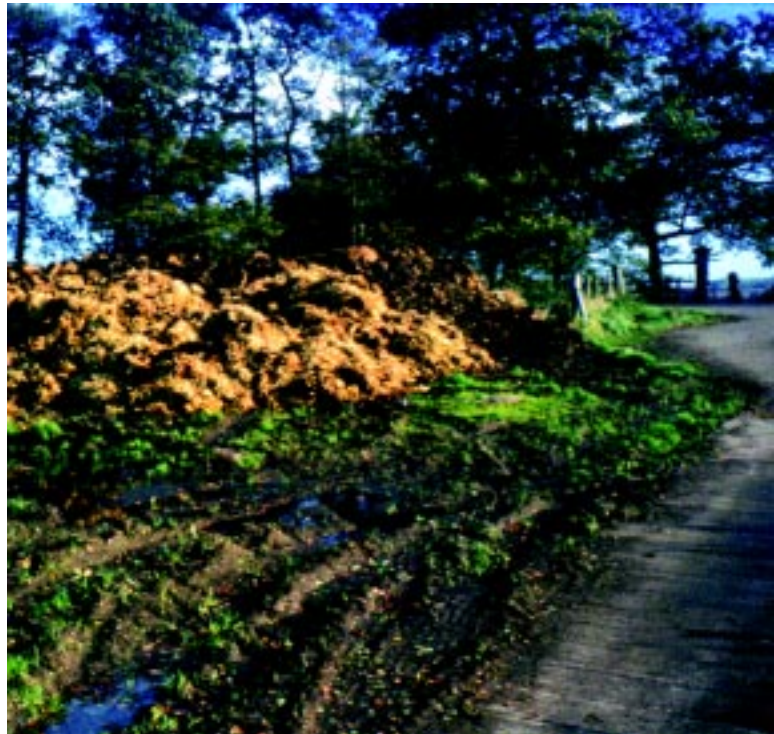
A suitably sited temporary field heap could be used instead of a yard midden.