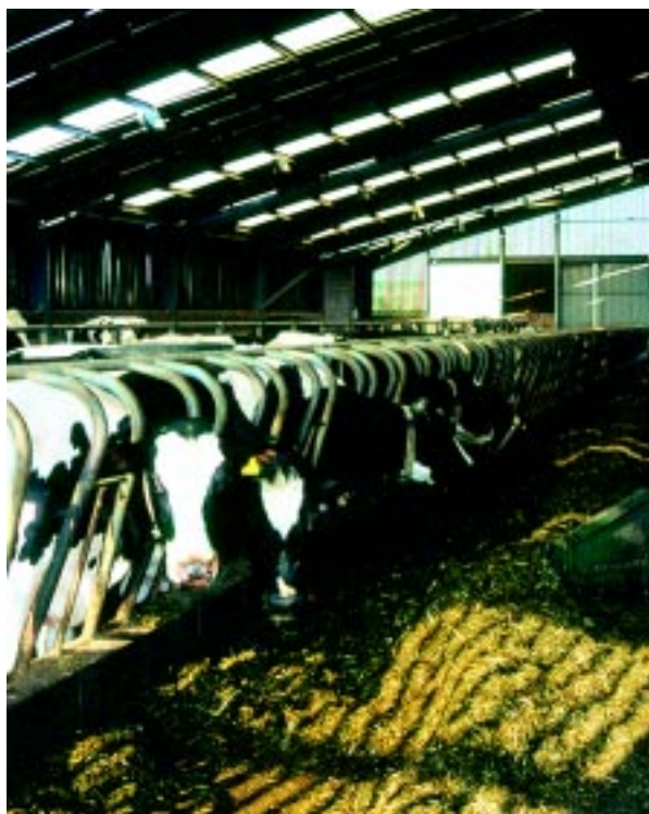
Nutrient values depend on a number of factors, including stock diet.

Slurry and manure from both housed and grazing livestock can make a significant contribution to the nutrient status of your land. Approximately three-quarters of nutrients in livestock feed are present in their dung and urine, making it a valuable source of NPK. Nutrients collected from housed livestock can be preserved through small changes in handling and storage of slurry and manure. For example, using a well-sited temporary field heap can reduce the amount of manure to be handled as the heap decomposes and make it easier to spread. Mixing slurry with water may make it easier to handle, but too much water will dilute the nutrient value and increase the total volume to be applied. Where possible, quick incorporation of slurry and manure into the soil will maximise nutrient potential. The less time nutrients are on the surface, the less chance they have to be washed away in surface run-off or escape to the air as a gas.