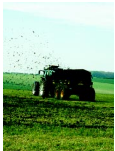
Manure application within recommended application rates provides valuable plant nutrients.

All slurry, manure, silage effluent and contaminated run-off (such as rain water on dirty yards or wash water) around the steading must be collected, stored and spread in accordance with guidance in the PEPFAA Code. Many factors dictate when and how much slurry and manure can be spread, including soil type, structure, slope and crop nutrient demand. Timing of application is also important, spreading in wet conditions poses an increased risk of manures and slurry washing off fields and into surrounding ditches, burns and rivers. Planning slurry and manure applications in line with crop or grass requirement is essential to get the best use of nutrients. Guidelines contained in Table 11 suggest single surface application rates in optimum conditions, as promoted by the PEPFAA Code. Given satisfactory conditions, repeat applications of these volumes can be made after a minimum period of 3 weeks, in accordance with crop or grass nutrient demand. Maintaining a minimum 10m no-spread zone bordering any watercourse or 50m around wells, springs and boreholes (used for drinking or dairy units) will help to reduce bacteria and nutrients getting into the waters around your farm.