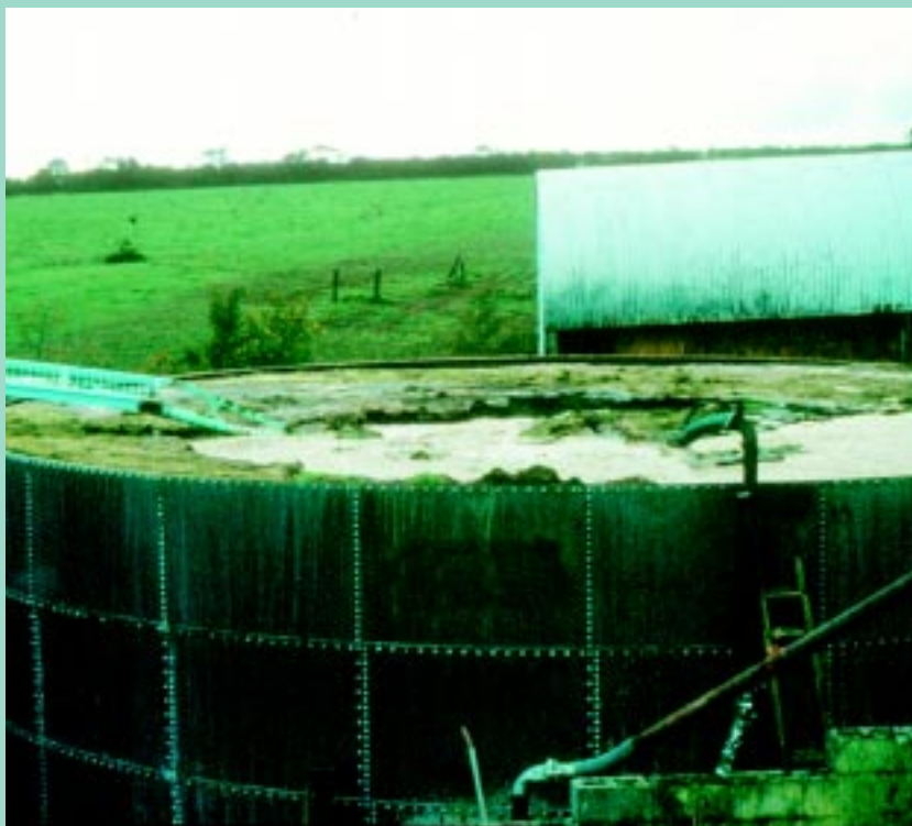
Exceeding storage capacity can increase pollution risk.

Having a professionally produced Farm Waste Management Plan (FWMP) for your farm may be used to justify less than six months slurry storage capacity as required under the Control of Pollution (Silage, Slurry and Agricultural Fuel Oil) (Scotland) Regulations 2003. A full FWMP for the purposes of the 2003 Regulations requires more detail than is provided by the step by step advice in this plan, guidance on how to move towards a FWMP should always be sought via a suitably accredited agricultural consultant or other specialist. More information on farm waste management planning is contained in Appendix 3 and the PEPFAA Code.