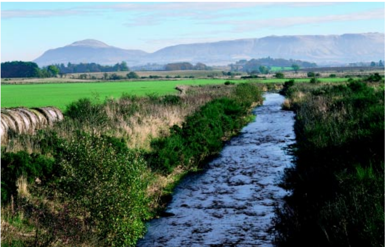
Managing water margins leads to greater biodiversity and can reduce pollution risk.