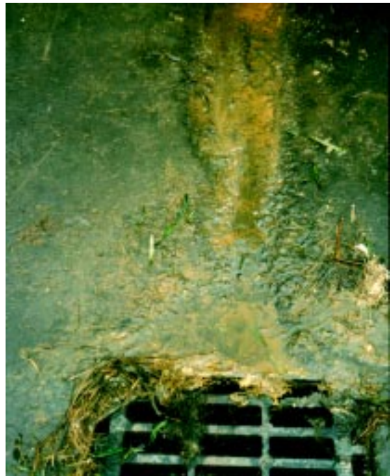
Contaminated material should not enter clean water drains.

There are many sources of dirty water around yards and steadings. Cattle crossing yards can deposit a significant amount of manure and slurry on yard surfaces, rainfall will wash some of these materials into drains and ditches around the farm. Rainfall running through middens, silage clamps, feeding areas and on to dirty yards collects nutrients and bacteria, adding to the problem of slurry and dirty water storage. Any run-off containing faecal matter, e.g. from yards or a midden, must be collected and contained in accordance with the Control of Pollution (Silage, Slurry and Agricultural Fuel Oil) (Scotland) Regulations 2003.