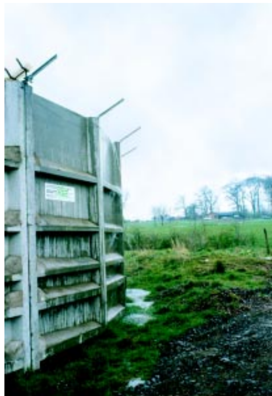
Overflowing dirty water storage facilities can increase pollution and runoff.

Your local agricultural consultant or specialist adviser will be able to provide guidance on taking these ideas further. Sources of further information are contained in Appendix 1.