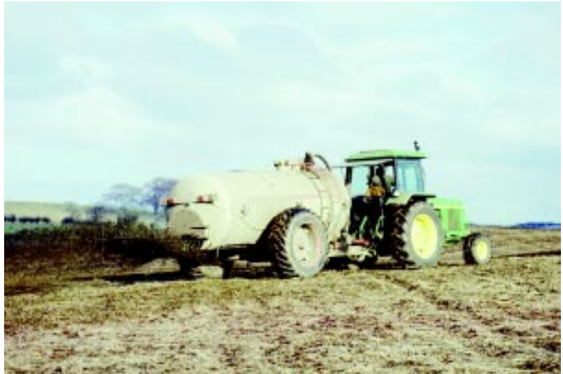
Low level spreading reduces odour nuisance.