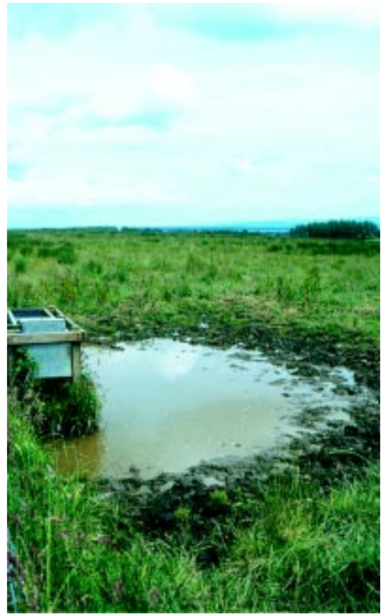
If possible, water troughs should be sited away from watercourses to reduce pollution risk.

Buffer strips around ditches, burns and rivers will reduce the risk of pollution entering the water. Try to prevent direct access of livestock to watercourses around your farm. Consider your watercourses on the farm and decide where you could add a buffer strip or prevent livestock access to protect stock health and reduce pollution risk. Sources of further information are contained in Appendix 1.