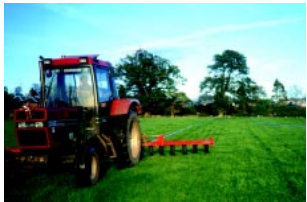
Slurry application using an umbilical system.