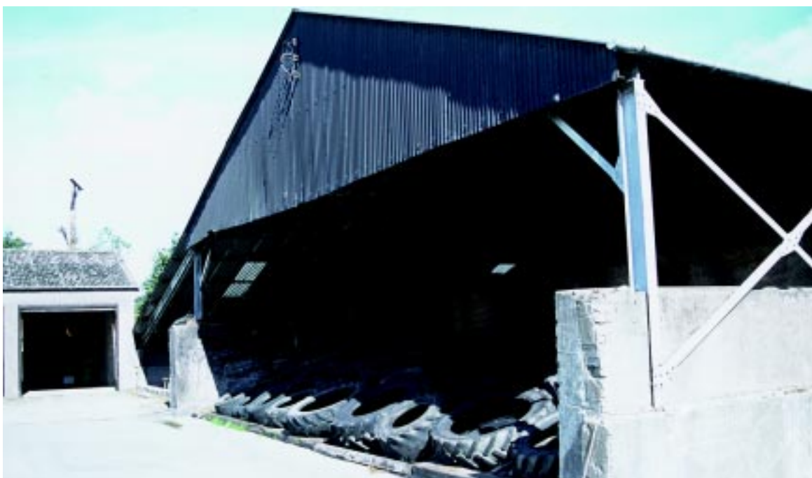
Roofing silage clamps reduces the amount of runoff to collect and store.