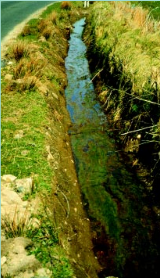
Pollution can lead to poor water quality.