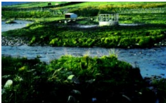
Poor siting of feeding rings can increase pollution risk.

Siting of troughs, pumps and ring feeders should be carefully considered, as these areas are prone to poaching and livestock defecation.