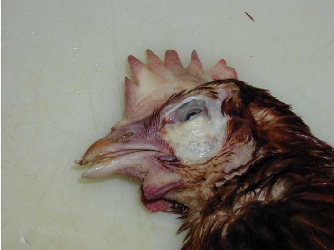
Figure 3 : Unilateral caseous cellulitis