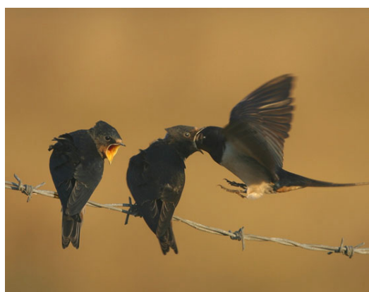
Barn swallows collect dung-associated insects for their young when flying over fields grazed by livestock.